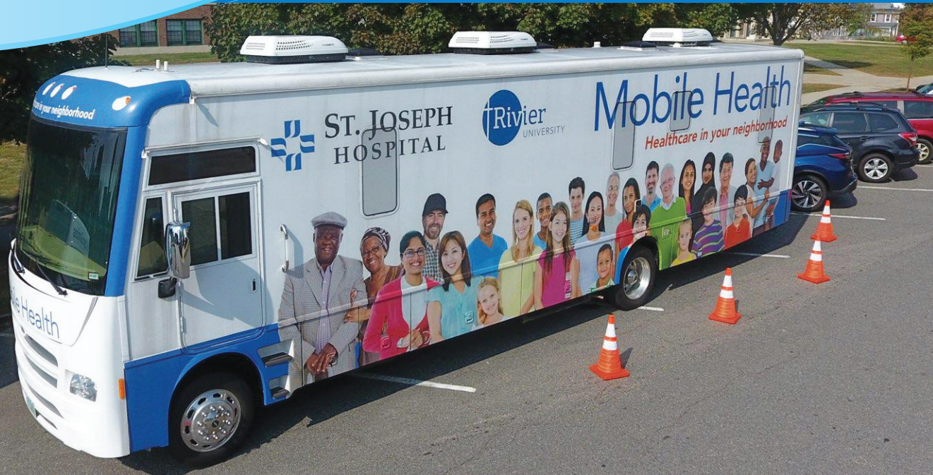
The Mobile Health Clinic in action. ▲