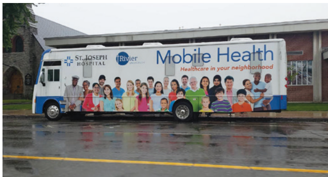
The Mobile Health Clinic hits Main Street, downtown Nashua. ▼

Will you help us keep rolling forward? Your gift to the Mobile Health Clinic helps us meet people where they're most comfortable — in their neighborhoods. Use the enclosed envelope to send your gift or donate online at stjosephhospital.com/give .